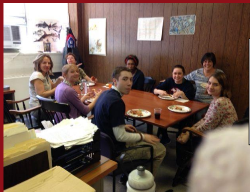
Biology Central Services threw a pizza party and gave certificates out to all of their student employees.