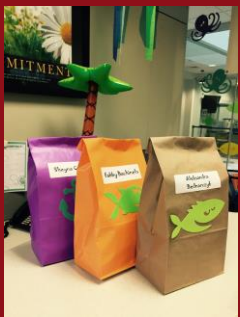
Goody Bags were given out to all of the students working in Financial Aid