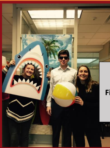
More fun in Financial Aid!