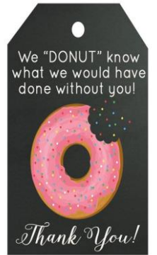
Printable tag from Pinterest

National Student Employment Week officially “kicks off” on Sunday, April 9 th and runs until Saturday, April 15 th . Please take a moment during this time to offer thanks and appreciation to your student employees for all of their contributions and efforts over the past year. Gestures of gratitude are appreciated in recognition of the fact that our student employees play an integral role in keeping the University of Connecticut running. Here are some highlights from last year’s celebrations to use as inspiration!