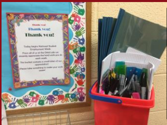
Token of thanks from the Child Labs